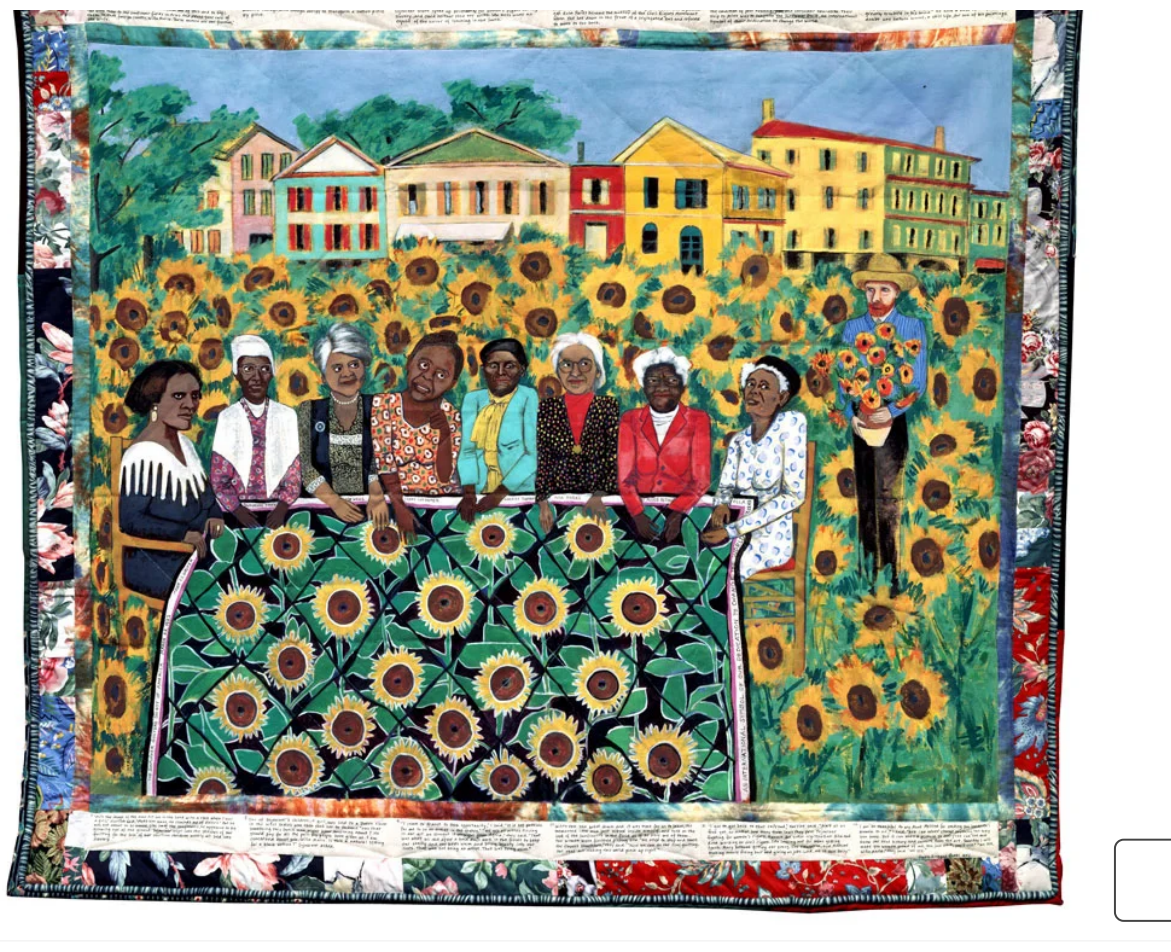
Faith Ringgold, The Sunflowers Quilting Bee at Arles: The French Collection, Part I, #4 , 1991.

Six Contemporary Artists Working in Quilting, Textile Arts to Know - ARTnews.com